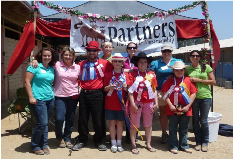
CALNET 2010 Volunteers and Riders